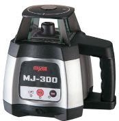
Automatic Rotating Laser