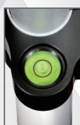
Built-in Circular Level 40' / 2mm