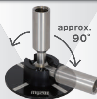
Flexible Flat Shoe RCP-FF