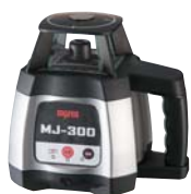
Automatic Rotating Laser