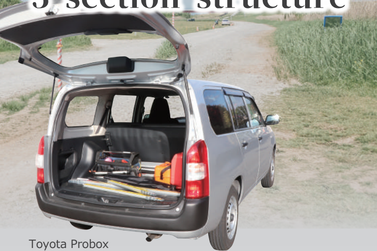
Toyota Probox Trunk Size : Width 1,420mm